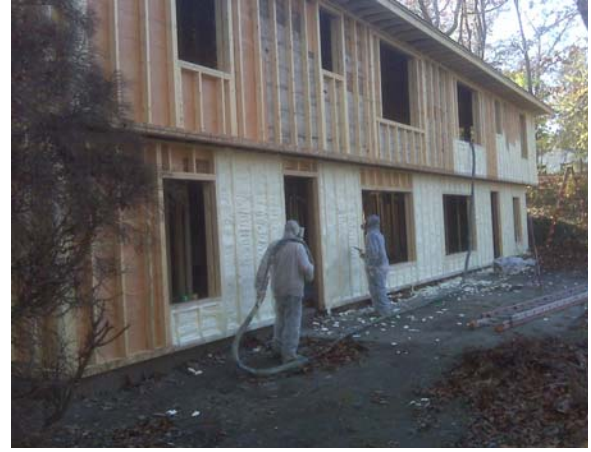
The site opens up to a walkout basement in the rear