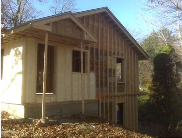
Exterior showing new exoskeleton with closed cell foam