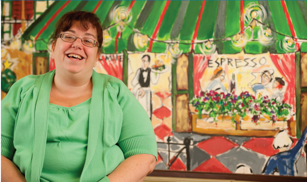
Spumoni's Restaurant Pawtucket, RI