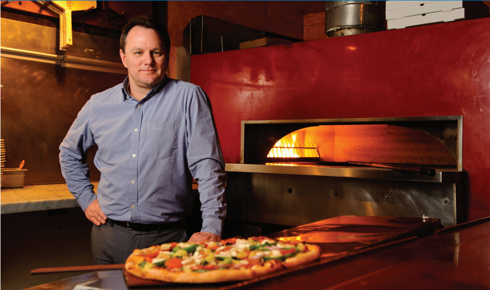
MewsTavern Wakefield, RI