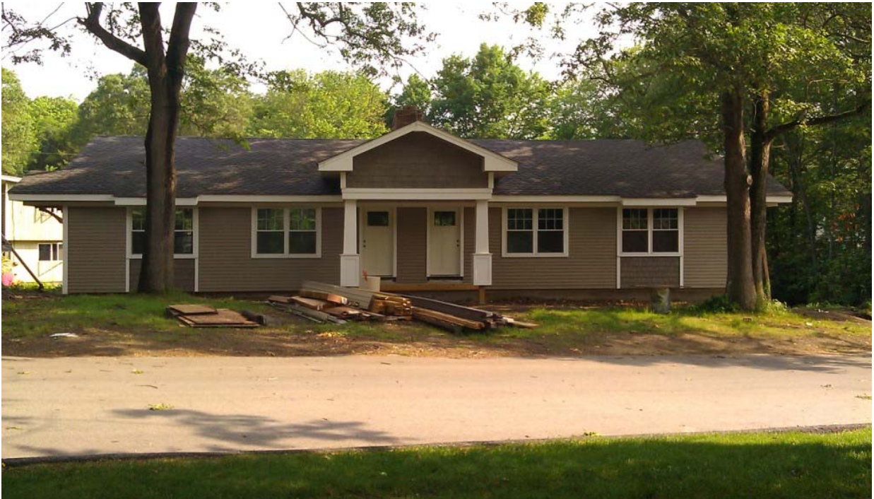
Front façade with new entrance portico. The new truss roof allowed for additional insulation as well as improved water management and shading.