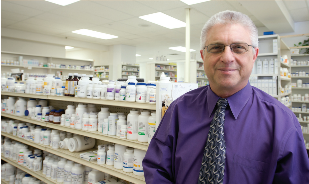
Phred's Drugs Cranston, RI

“ The lights are nice and bright and the LED cooler lights enhance the product. I was impressed. It was easy there was no disruption to my business. ”