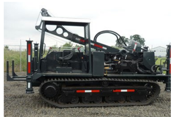
Example Soil Boring Machine