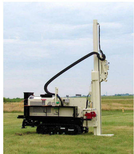
Soil Boring Machine