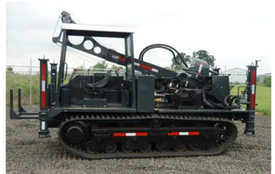
Soil Boring Machine