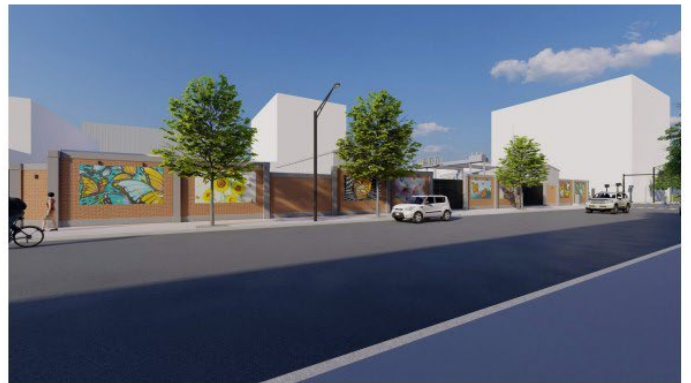
View 4 - Common Street Frontage