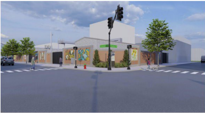
View 1 - Intersection of Common and Amesbury Streets