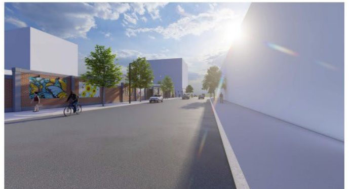
View 3 - Common Street Looking West