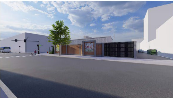
View 2 - Amesbury Street Looking East